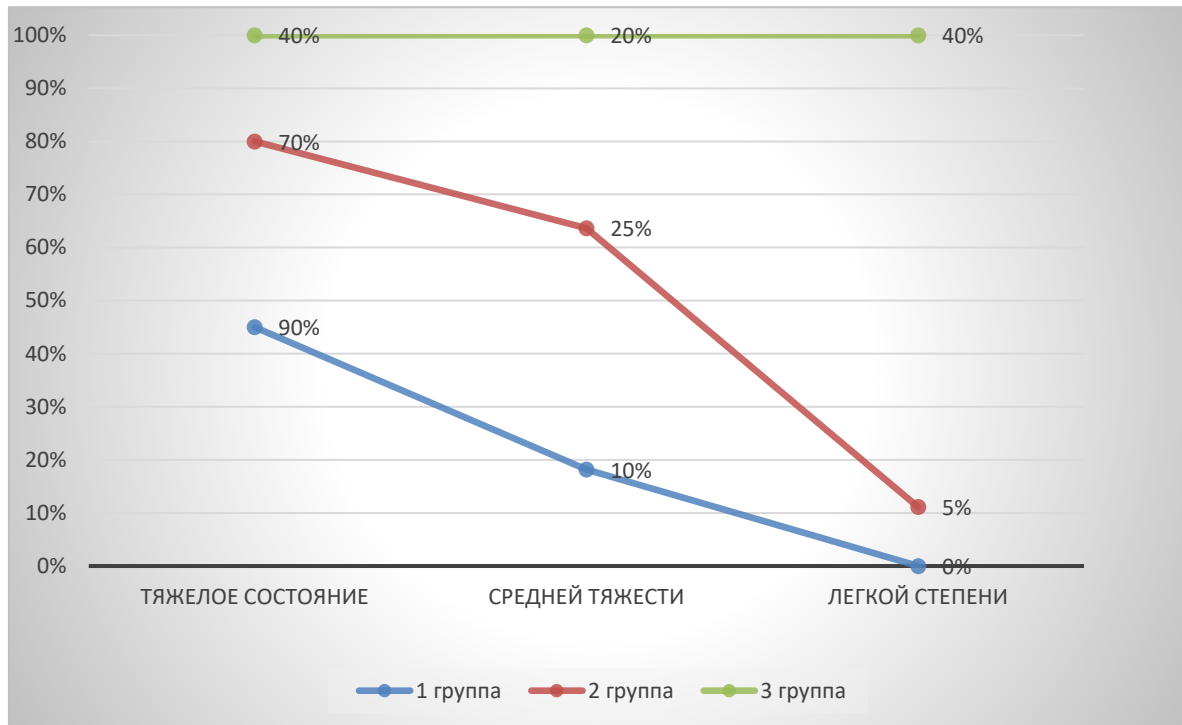
Figure 3. Distribution of newborns in the compared groups according to the severity of the general condition.

The main scale used to determine the assessment of the condition of the newborn and the degree of asphyxia in the child is the Apgar scale. In this regard, during the study, it was found that low scores on the Apgar scale at 1 minute of life were detected in newborns with HIE of all compared groups, but with a greater frequency in newborns of groups 1 and 2 and significantly in relation to both healthy newborns ( p < 0.001 ), and to the group of children with HIE but born with a normal gestational age. Neonatal vital activity indices at the 5th minute of life in the 1st group of the study remained at 1-3 points in 50% of newborns, in group 2 this indicator was only 20%, while all children with normal gestational terms with an assessment of 1-3 points showed improvement states.