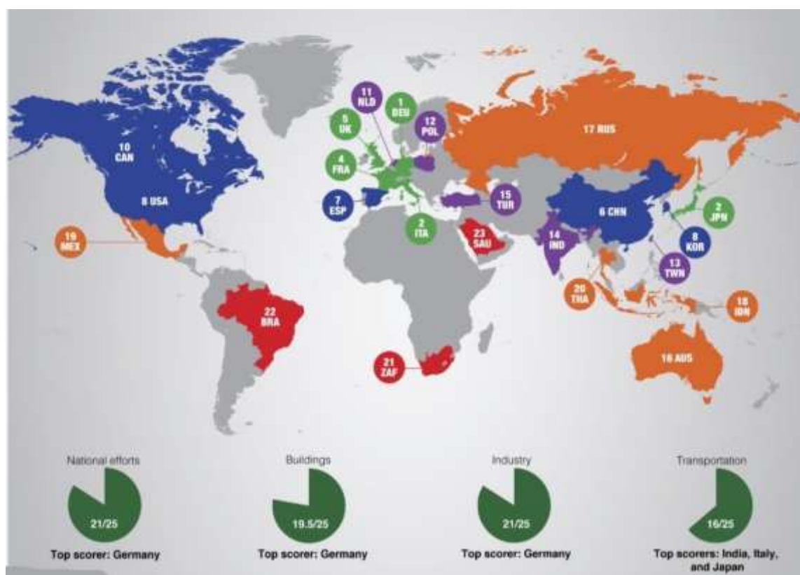
Picture.3. 2022 year International Energy Efficiency Scorecard